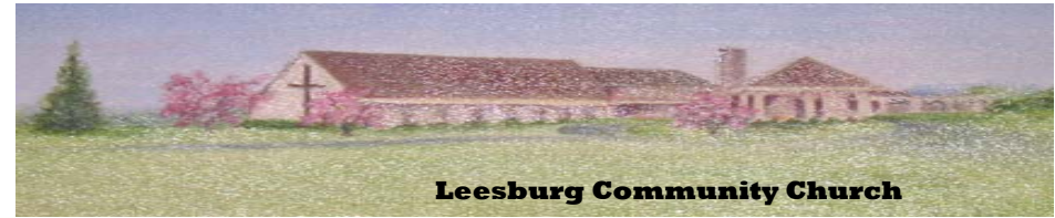
Leesburg Community Church

Phone: 703-771-7625 Fax: 703-779-2018 E-mail: PLC@LeesburgCommunityChurch.org www.leesburgcc.org